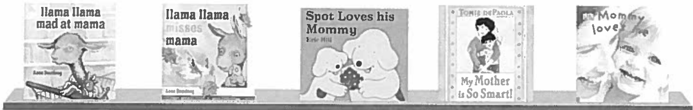
Llama Llama Mad at Mama For Ages 4-7